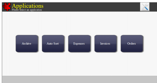
Choose your workflow/process directly at the MFP's panel

Kyocera's HyPAS (Hybrid Platform for Advanced Solutions) is a powerful and scalable software solution platform. Through integration with widely accepted software applications, HyPAS will enhance your specific document imaging needs, resulting in improved information sharing, resource optimization and document workflows.